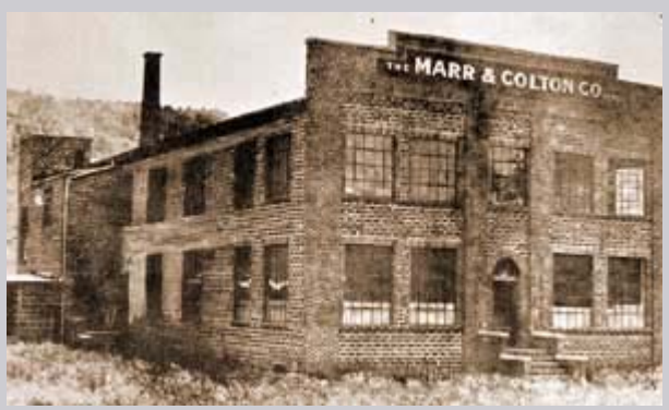
The newest section of the Marr & Colton factory

The first theatre organ produced by the infant concern was for the Oatka Theatre in Warsaw. At the height of its operation in the 1920's, the company had branch offices in New York City, Detroit, and Hollywood, and some 375 people were employed by the firm. The custom was to build